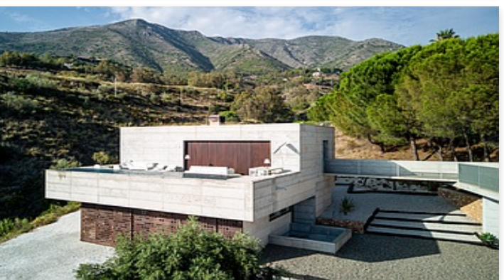
Luxury contemporary villa with minimalist design in the Valtocado Urbanization, Mijas